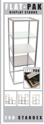
Flat-Pak Product Display Stands