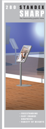
Sharp Freestanding Graphics Stand