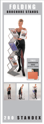
Folding Brochure Display Stands