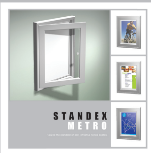
Metro Stock Sized Cost-effective Lockable Notice boards

If you would like any further information on our product range or would like us to send you one of our brochures please call: